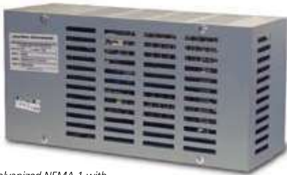
Galvanized NEMA 1 with normally closed thermostat

The cyclic duty kits are intended for heavy duty applications that need the capability to dissipate regenerated energy on a more continuous or repetitive basis such as downhill conveyors, hoists, feeders and dynamometers.